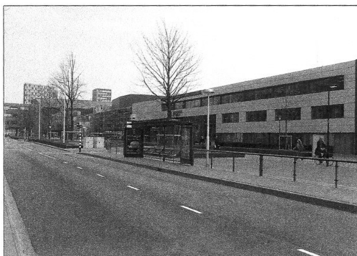
Hogeschool Utrecht. Uithof campus

Even though a vacant is satisfied they let the information remain published; they prefer that every firm itself communicates students whether the offer is still available or not: this gives more transparency to the whole process and everybody can know what sort of internships are offered or could be offered again in the future. On the other hand, perhaps a firm does not need an intern at one specific moment but maybe it will interesting to have a pool of candidates after current interns finish their internships.